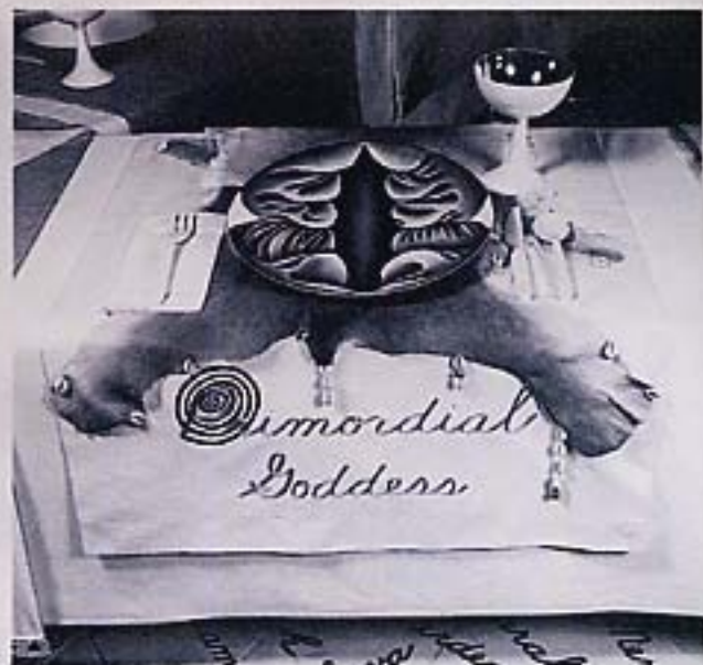
The Dinner Party , installation view and "Primordial Goddess" place setting

Chicago went on to create other collaborative works, including the Birth Project (1980–85) and the Holocaust Project (1985–93), and to receive a slew of grants, awards, and honorary degrees. Her Through the Flower organization, established in 1978 to help facilitate the completion of The Dinner Party , works to create programs promoting women's cultural achievements and to promote Chicago's own work. Recently, she helped create the Feminist Art Project, a website for exhibitions, symposia, publications, courses, and other special events designed to highlight feminist artists.