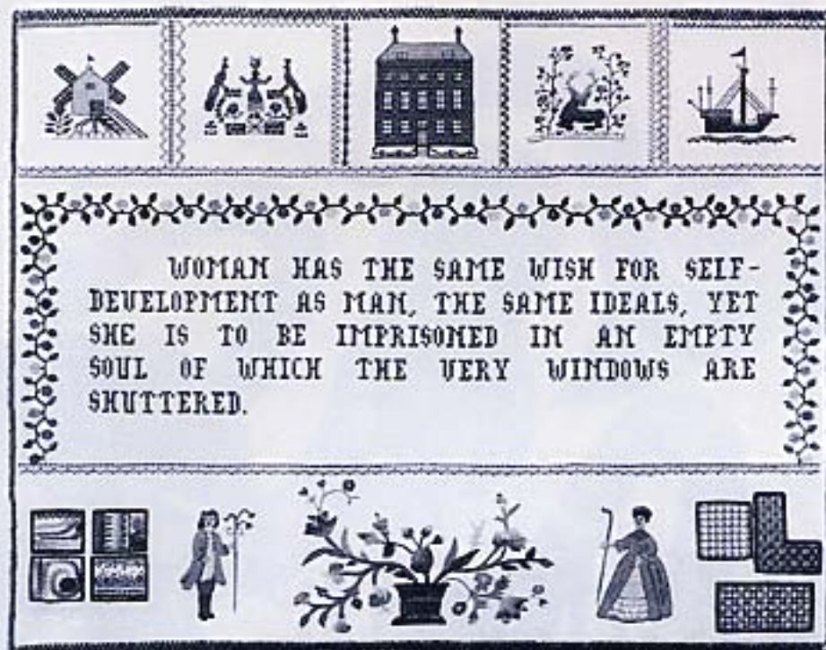
The Dinner Party, detail, "Anna van Schurman" runner

read it much earlier—like when I was first learning about women artists 10 years ago!